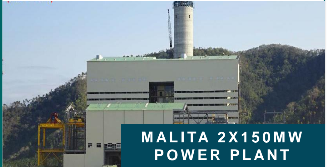
MALITA 2X150MW POWER PLANT