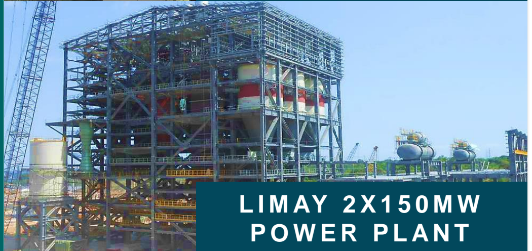
LIMAY 2X150MW POWER PLANT